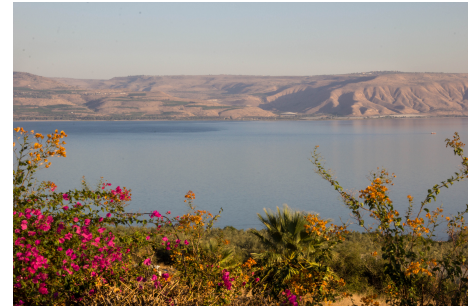
Petra: Petra Palace